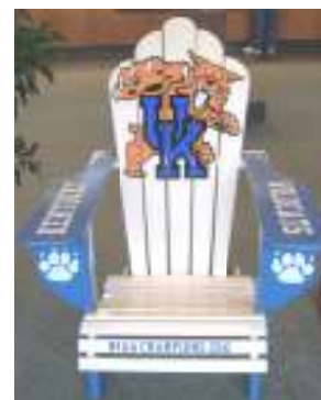
Hand-painted Adirondack chairs were donated for the live auction.

Thanks to scores of individuals and businesses that donated auction items, more than fifty event sponsors, and those who purchased tickets, the event netted